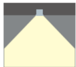
COB LED CRI≥80 IP44 CE RoHS